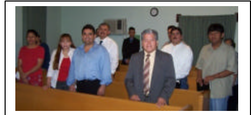
Brethren at Mirador congregation