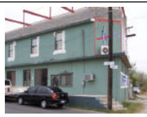
Where the church meets at Colonia Mirador in Piedras Negras, Coahuila, Mexico