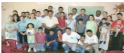
Costa Rican Christians