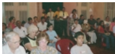
Worship in Tilarán