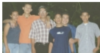
The Reyes Family