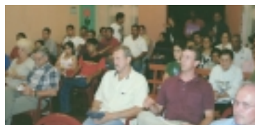
Worship in Tilarán