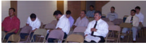
Men's and women's Bible classes