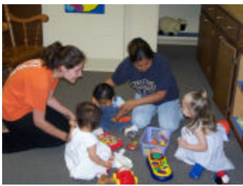
Children Bible classes