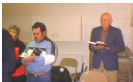
Worship in song in Spanish