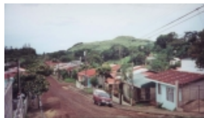
Tilarán, Guanacaste, Costa Rica