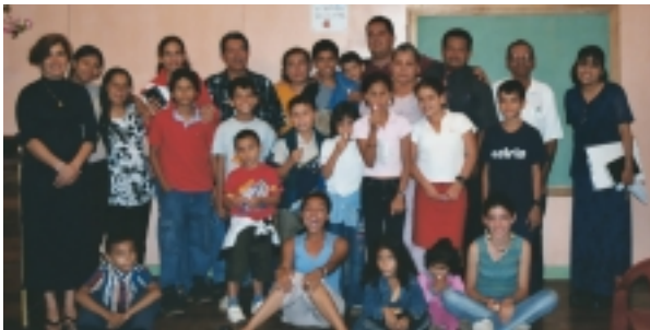
Members of the church in Tilarán