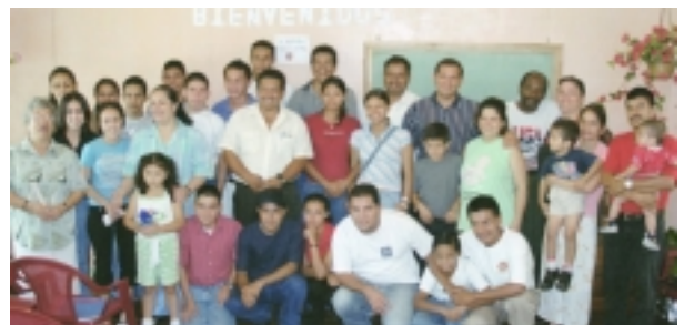
Members of the church from various places in Costa Rica who came to Tilarán to work in the campaign