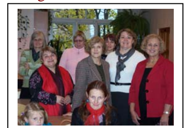
Ladies' Bible class