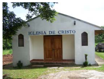
The church building at Tilarán