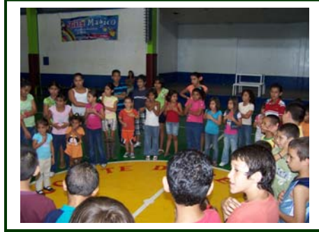
The children singing