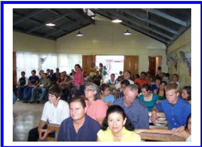
Worship at Cañas