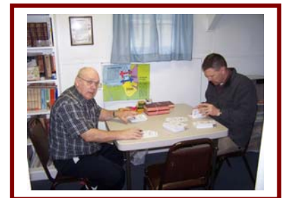
Door-knocking and preparing flyers and tracts for going door-knocking