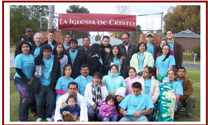
April, May & June 2009

“Go ye into all the world and preach the gospel to every creature” (Mark 16:15) “Id por todo el mundo y predicad el evangelio a toda criatura” (Marcos 16:15)