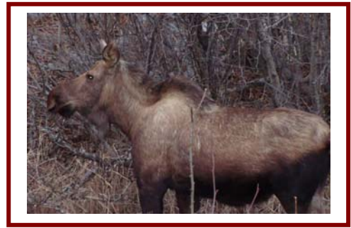
Alaska wildlife seen in town or from the highway: Bald Eagle, Mountain Goat and Moose

The work at Mabelvale among Hispanics continues to grow through the preaching of the gospel and have a positive influence in other countries as well.