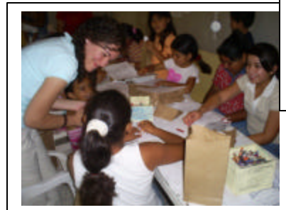
Children's Bible classes at Zaragoza