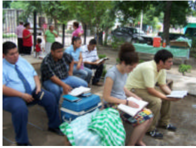
Youth Bible class at Zaragoza