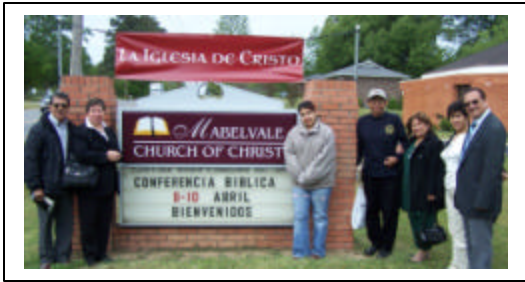
The group from Mexico and Peru getting ready to knock doors