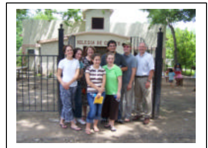
Mabelvale group at Zaragoza