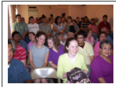
The congregation at La Guillen in Piedras Negras, Coahuila. A congregation of about 100 in attendance on Sunday