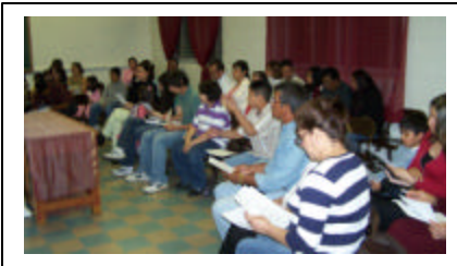
The congregation at Getwell in Memphis, Tennessee where the brethren from Mexico also taught and preached