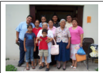
The congregation at Zaragoza, Coahuila