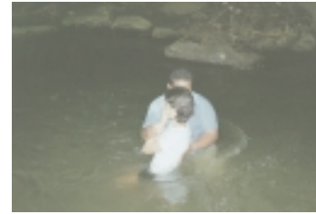
Baptism at the river in Costa Rica