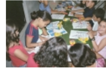
Children in Bible class