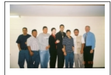
Members and visitors